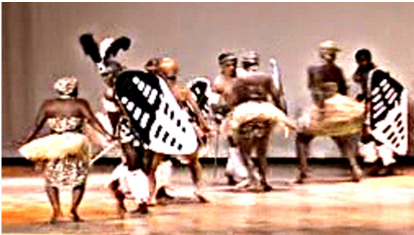
Photos from HBDA's African number which opens the show.

The show celebrates America's rich and diverse history and the exciting dances that are an integral part of it. Each of these dances grew out of the African Diaspora making them truly North American indigenous dances. These dances were so pervasive in their time that they leapt from community to community making them internationally known and done in the world's societies. They have left a legacy we cannot dismiss.