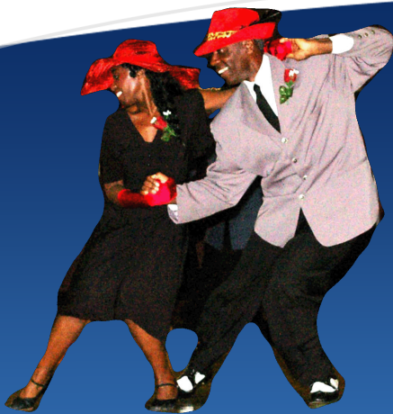
A photo from CADE's recently produced "The History of Black Dance in America"