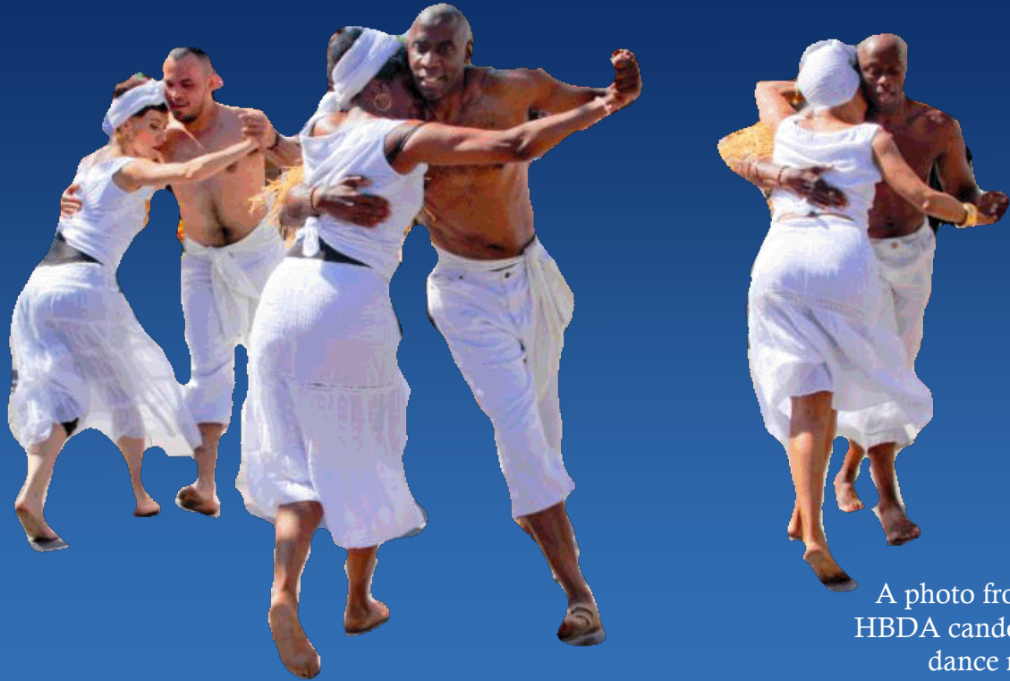
A photo from CADE's HBDA candome/milonga dance number